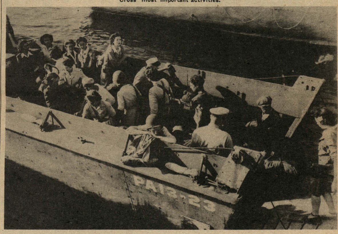
These Red Cross girls, the first to leave for Southern France, are getting into Headed for France an assault vessel which will carry them to the troop transport in the harbor. The girls were serving coffee and doughnuts to our troops from clubmobiles 20 days after the initial landing on the Normandy beachhead.