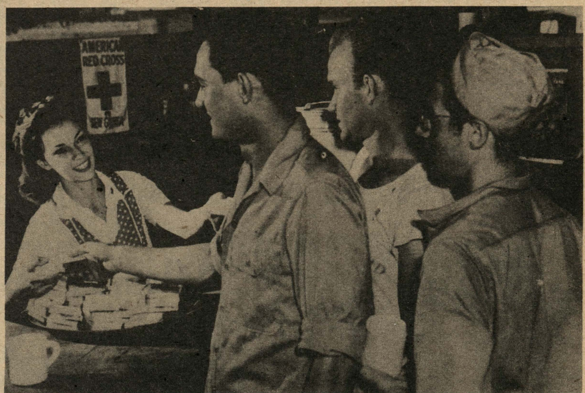
In New Guinea A pretty Red Cross aide distributes sandwiches to American servicemen in New Guinea Guinea. There are now 727 clubs for servicemen overseas. This is one of the Red Cross' most important activities.

Wherever there is suffering to be relieved or aid is needed, you'll find the Red Cross. In the field hospitals, the canteens, on the battlefield itself, and on the home front, the familiar symbol of mercy is ever prominent. The photographs below are typical scenes of the Red Cross in action.