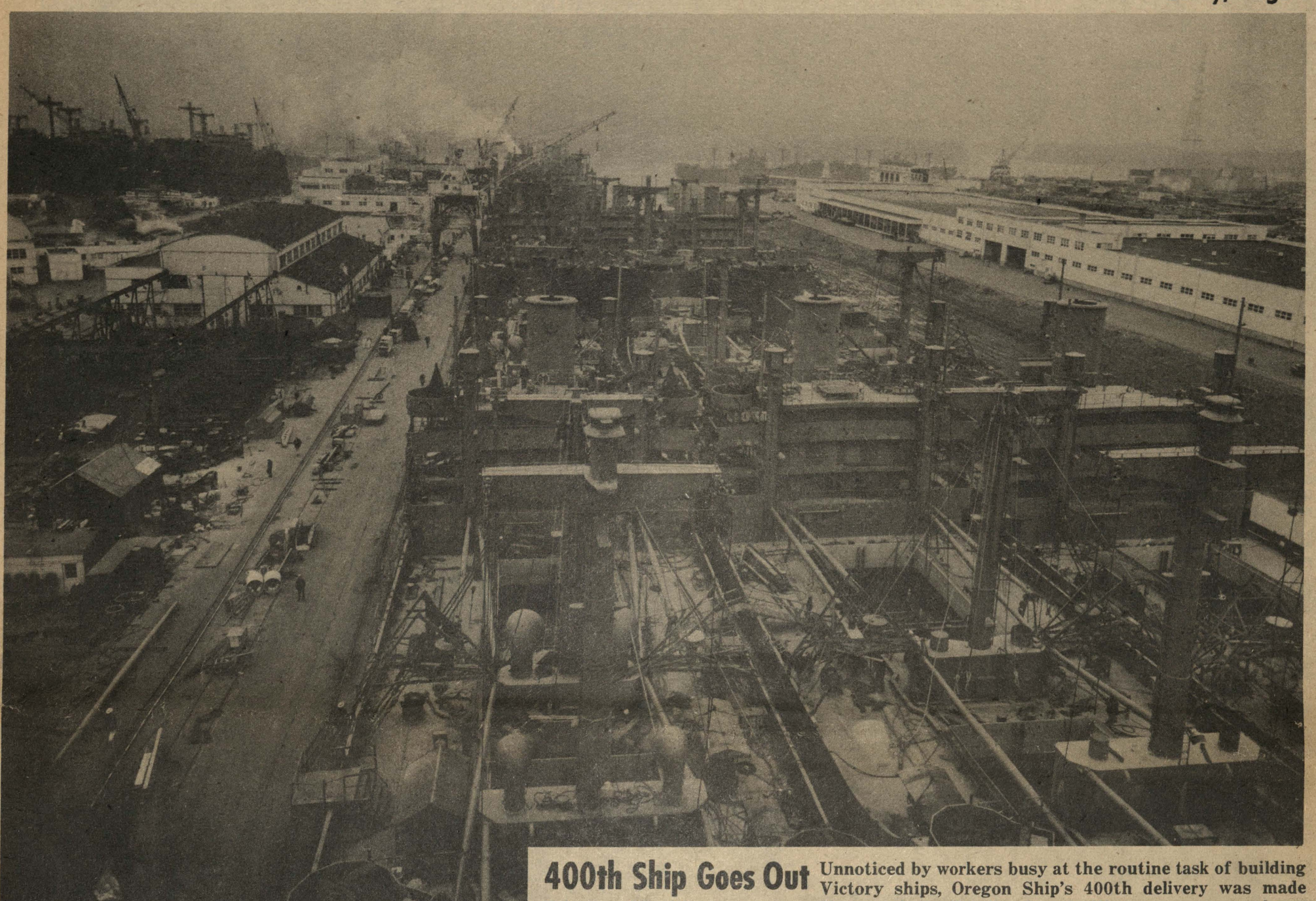
February 28 without ceremony. The vessel, the S.S. La Grande Victory, was to workers, "just another ship for our merchant fleet." This unusually inclusive picture shows Victorys on the ways, in the Outfitting dock and moored at the dolphins by the river's edge. The view was taken shortly before the La Grande Victory, one of the vessels shown at the far end of the dock, was delivered.