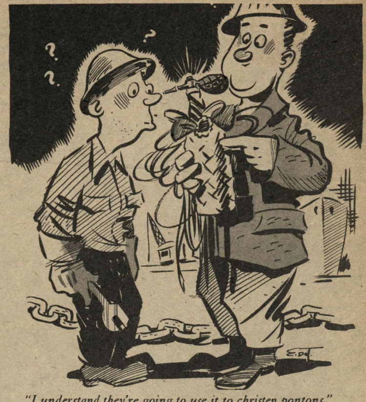
"I understand they're going to use it to christen pontons."